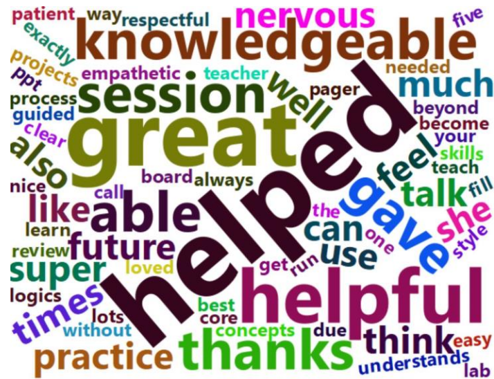
Figure 1. HGSE CommLab 2020-21 Consolidated Feedback

Note: Generated from anonymous feedback (n = 20) provided by HGSE Ed.D., Ed.L.D., and Ed.M. students via Qualtrics after 2020-21 HGSE CommLab webinars and/or TF one-on-one or small group appointments.